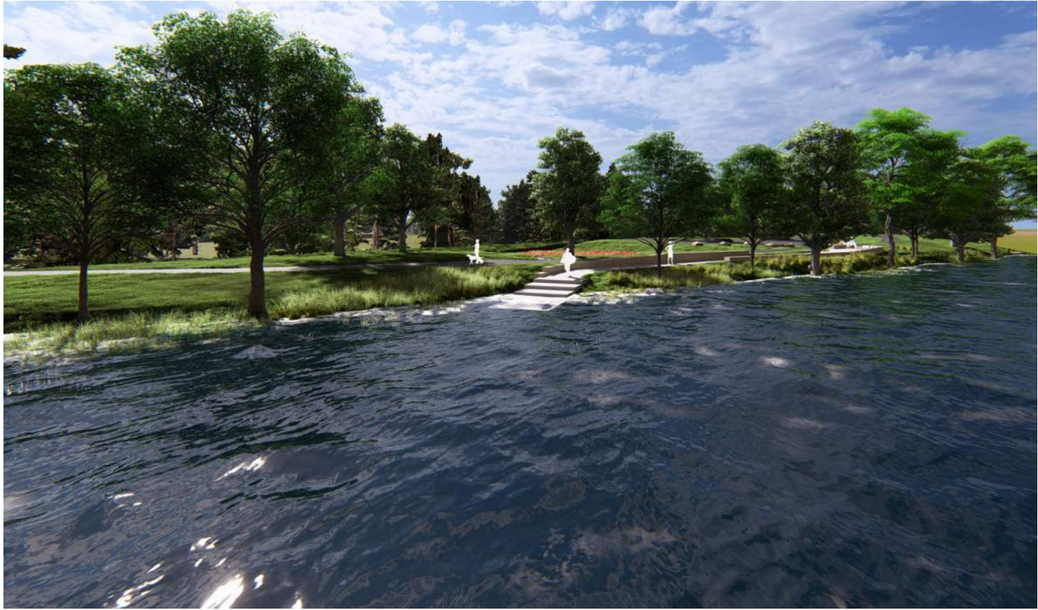
Stepped Canoe/Kayak Launch - High Water Level