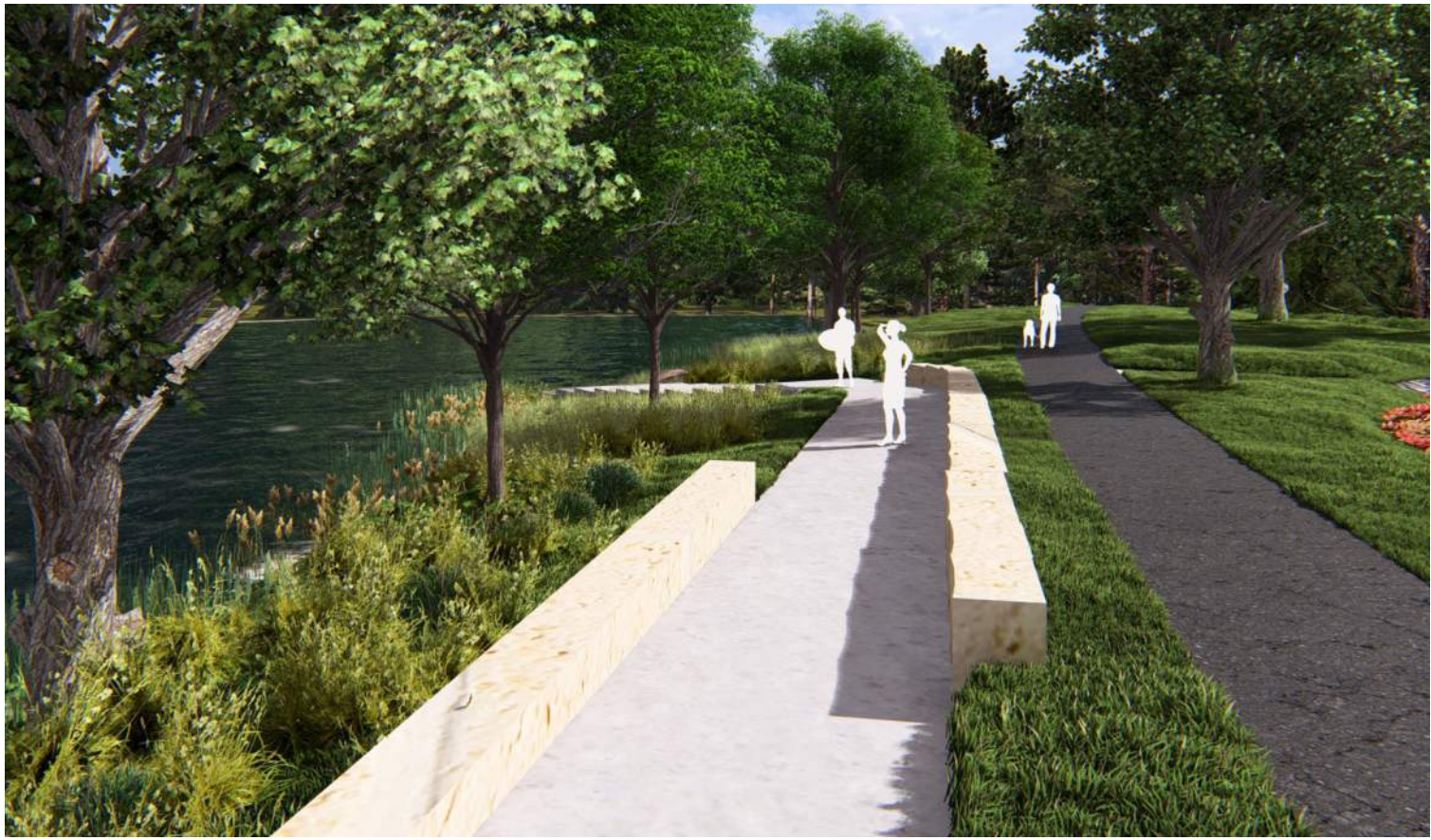
Walkway with Retaining Walls